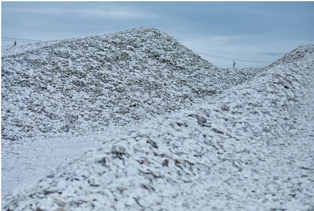
Wasted scallop shells piled up in Sarufutsu Village (photo taken in August 2022)

※Fisheries Promotion Division, Fisheries Bureau, Hokkaido Department of Fisheries and Forestry, "Survey of Fisheries Waste Generation in FY2021".